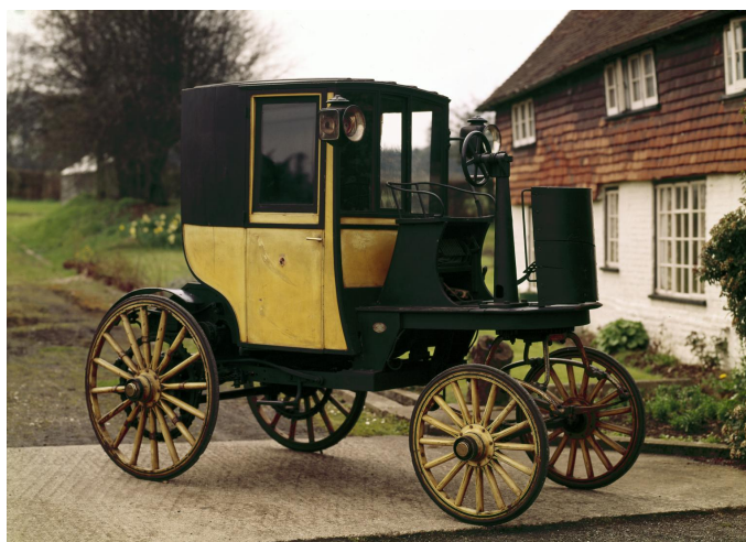
Figure 1: Source Science Museum, UK .

Taalbi and Nielsen (2021) argue that the lack of an electric grid was key in early US buyers and motor manufacturers switching to gasoline and diesel powered vehicles as more attractive, and these soon outcompeted electric cars in both total cost and distances that could be traveled. A reversal of these attributes is in sight again: an all-electric powered society is going back to a future where humanity might have been 125 years ago.